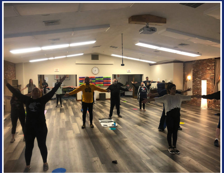
Three Treasures Health & Wellness co-hosted a tai chi course for our veterans. Post-service transition is different for every veteran and self-care plays a big role in a smooth transition.