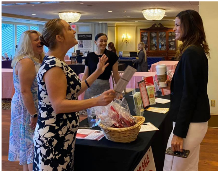
The first annual Women's Vendor Expo hosted female-owned businesses from around the 40th District for a day of building relationships and sharing their passion.

Rep. Mihalek is dedicated to creating legislation and holding events that are beneficial to the 40 th District.